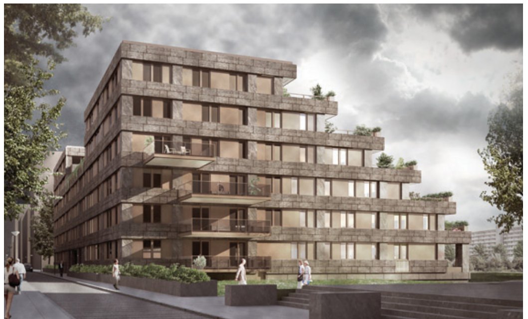
View from the west