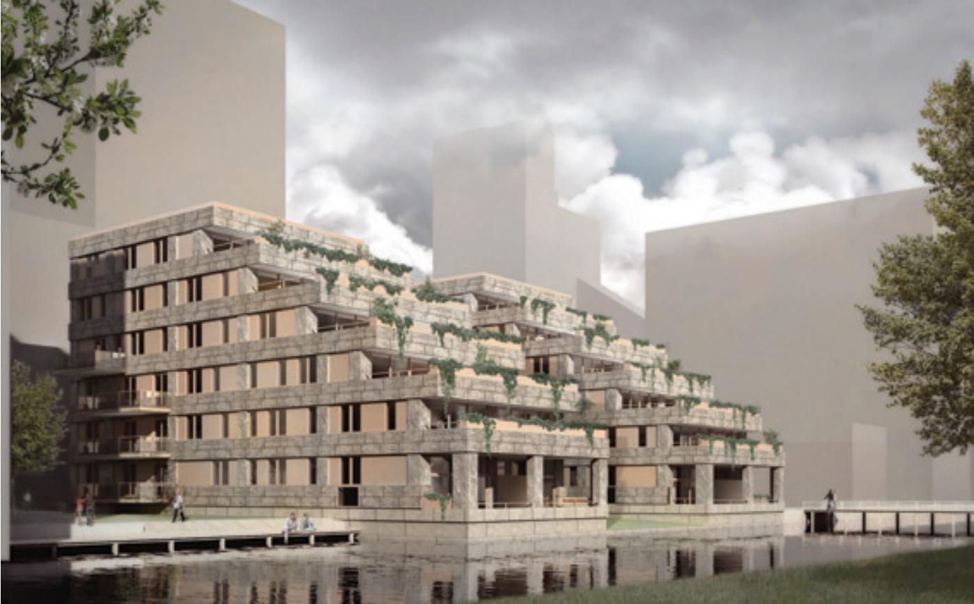
View from the Boelegracht canal