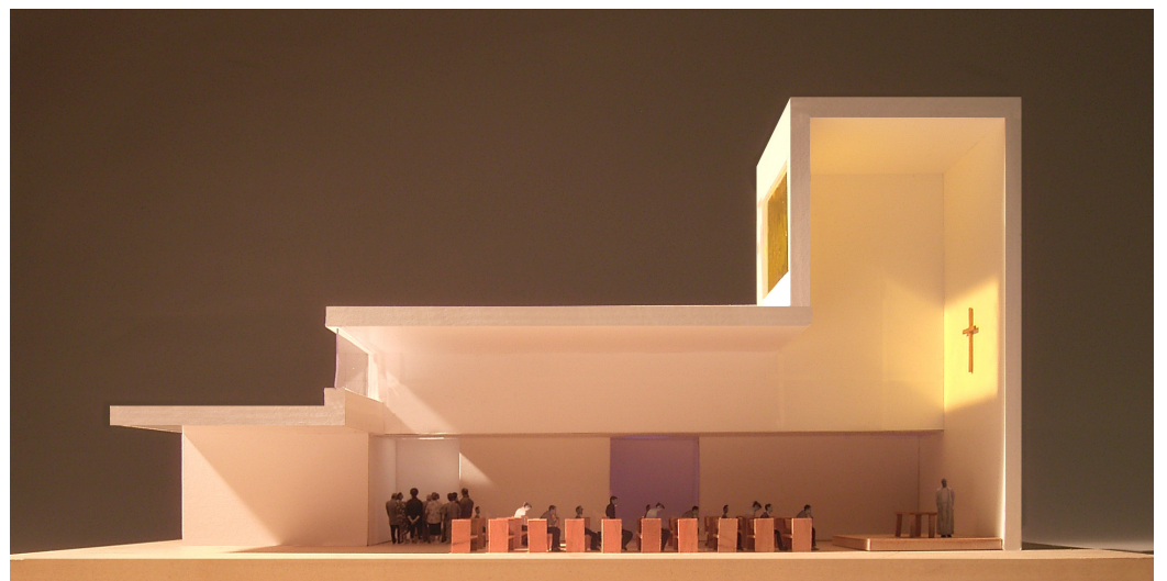
Sectional model of church