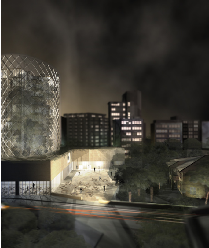
The complex in the evening