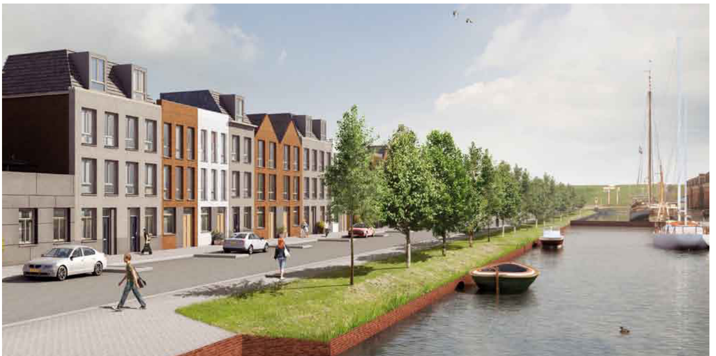
View along Molenplein