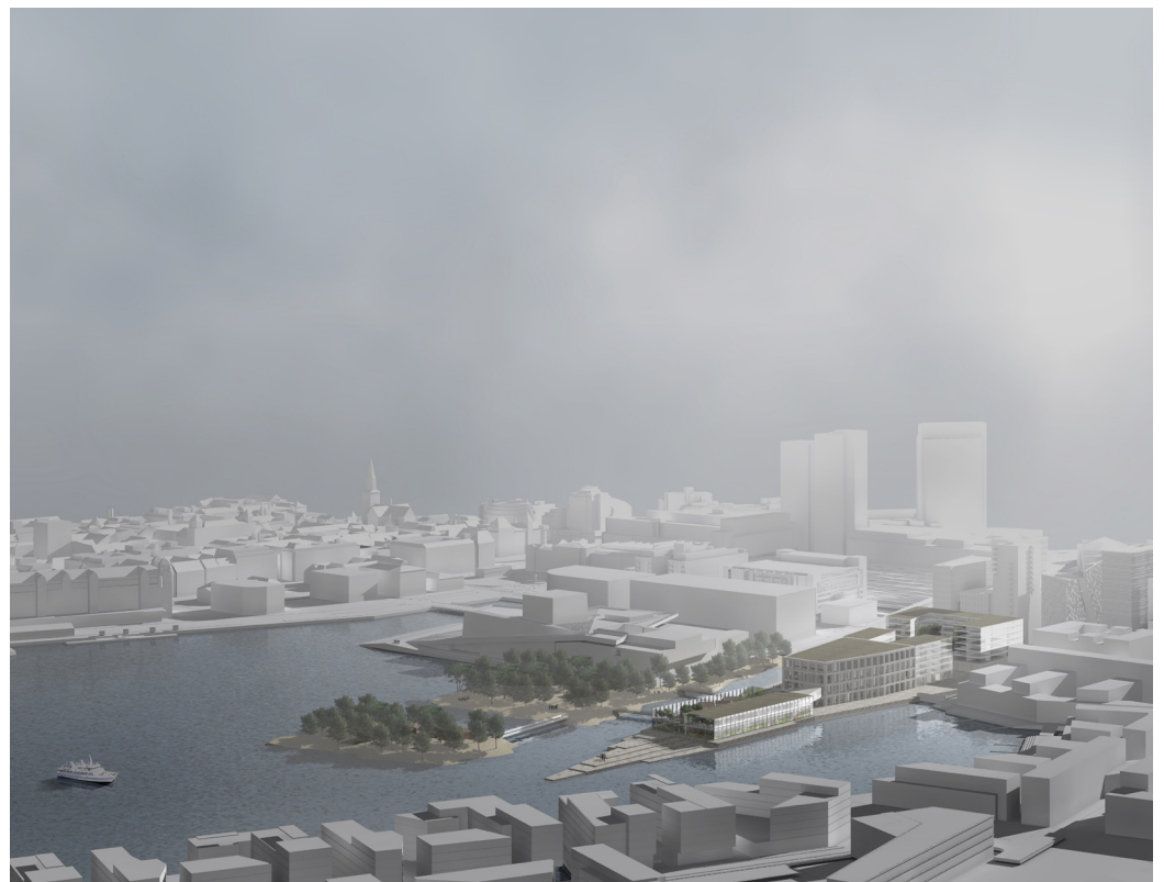
View from the hillside