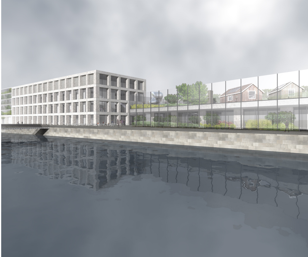
View from Akerselva