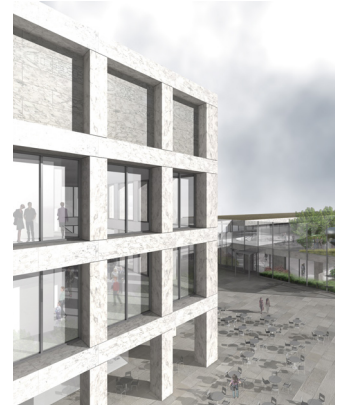
View of the facade

The buildings are arranged as pavilions around a square and complemented by new island parks and beaches along the fjord.