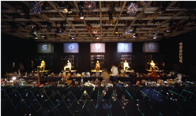
Spellbound Sound piece