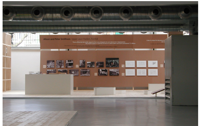
Entrez Lentement entrance lobby

A public exhibition curated by Pierluigi Nicolin for the Salone Internazionale del Mobile in Milan. The practice was one of eight contemporary architects invited to make an installation in response to eight classic modern houses of the 20th century. Tony Fretton Architects made an installation in response to the Smithson's Upper Lawn Pavilion.