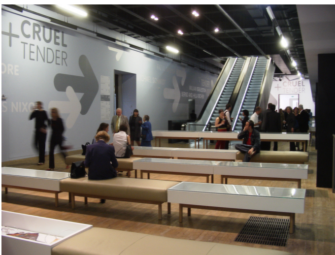
For Cruel and Tender the lobby of Tate Modern was used to incorporate archival material into the exhibition